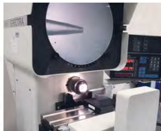
Every lot of APT™ tips are meticulously tested and inspected.

TIPS ARE SHOWN ACTUAL SIZE. SEE PAGE 6 FOR DEFINITIONS OF ALPHABETICAL SYMBOLS THAT APPEAR BELOW THIS BOX.