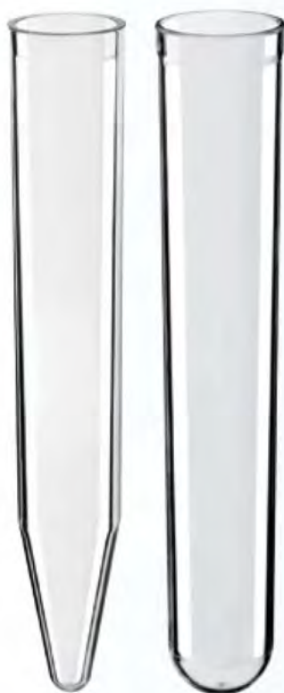
12 x 75mm, Conical