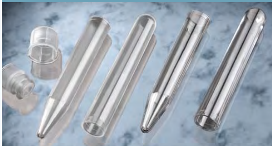
12x75mm Round Bottom and Conical tubes with dual position or plug style caps.